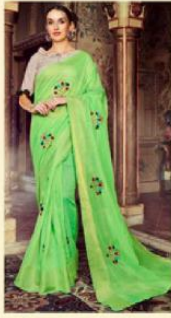
D.NO. - 3931