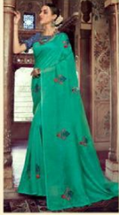
D.NO. - 3935