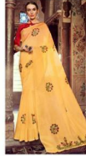
D.NO. - 3939