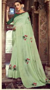
D.NO. - 3937