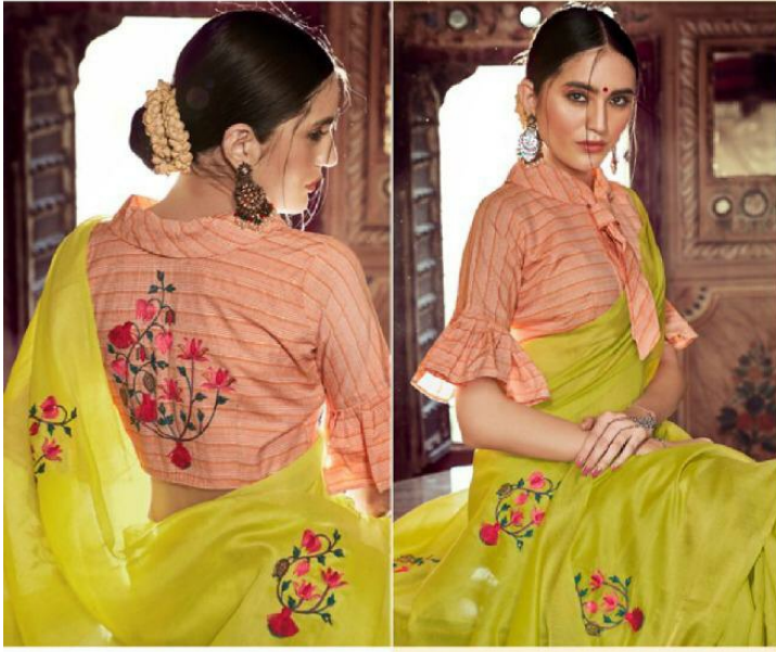
D. NO. - 3934