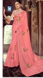
D.NO. - 3940