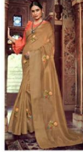
D.NO. - 3938