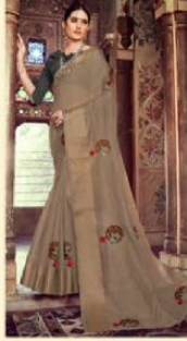
D.NO. - 3936