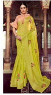
D.NO. - 3934