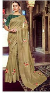
D.NO. - 3933