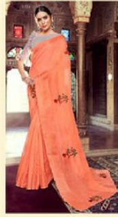
D.NO. - 3932