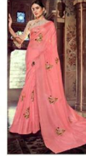
D.NO. - 3940