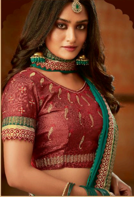
Emerald Isle 2407