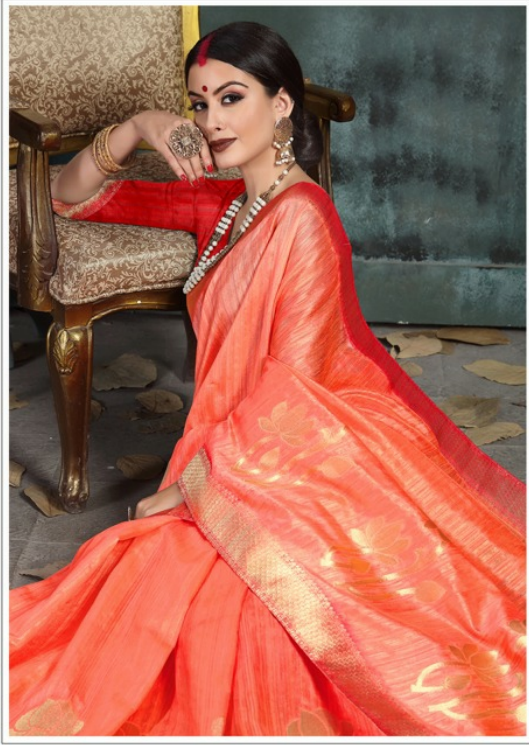
● Traditionally blessed in every ways ●