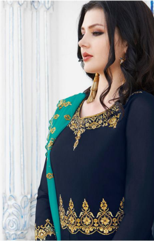
They don't always have to be about what you reveal but rather what you conceal or convey in a mood or an attitude. Some times tasting the loss and experimenting is interesting as well. The journey becomes more important than the goal itself.