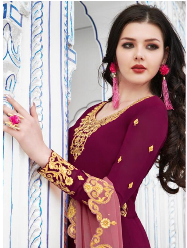
Shimmering net gown with contrast embroidery and organza. Shining embroidered gown embellished with antique cutwork detailing on delicate netting. Your bridal number isn't just for looking good, it's a piece of memory that you carry forward in your new life.