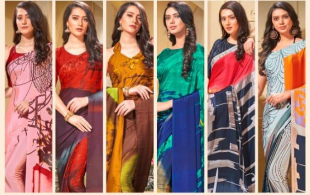
8003b 8004a 8004b 8004c 8005a 8005b