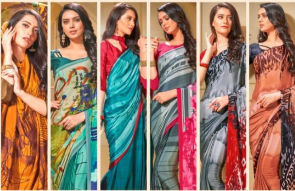
8006a 8006b 8007a 8007b 8008a 8008b