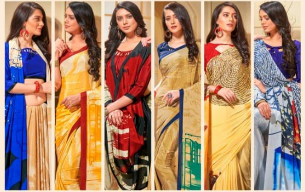
8009a 8009b 8010a 8010b 8011a 8011b