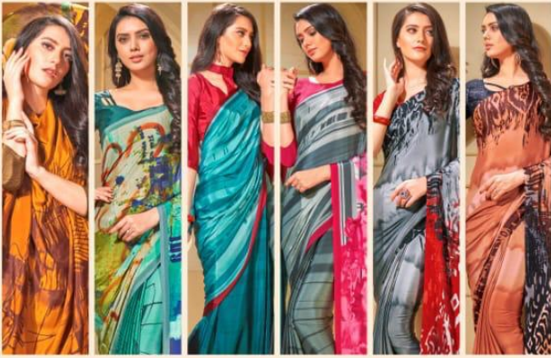
8006a 8006b 8007a 8007b 8008a 8008b