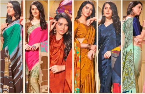
8001a 8001b 8002a 8002b 8002c 8003a