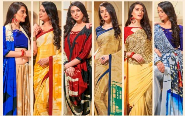
8009a 8009b 8010a 8010b 8011a 8011b