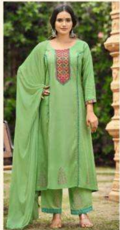
◦ 1006 ◦