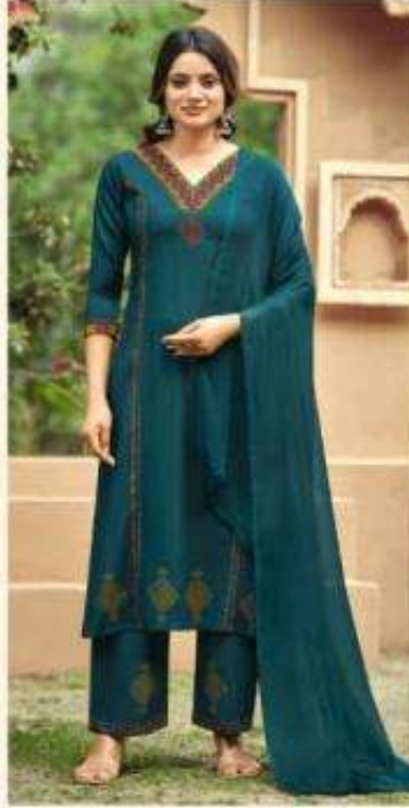
◦ 1002 ◦