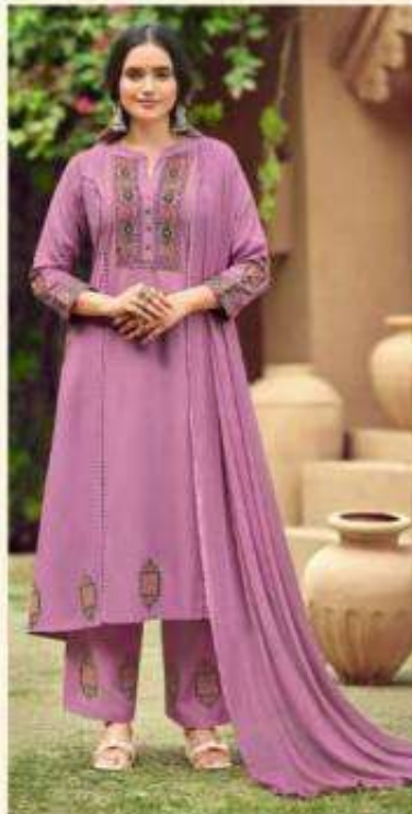
◦ 1005 ◦