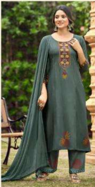
◦ 1004 ◦