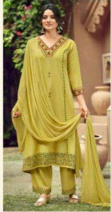
◦ 1003 ◦