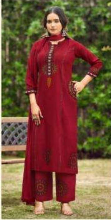
◦ 1001 ◦