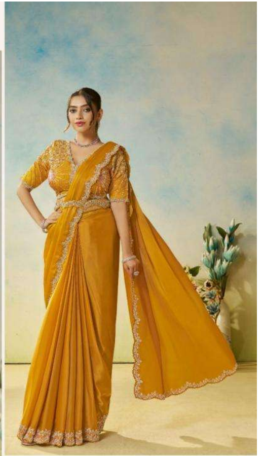
25702 FABRIC: SOFT SATIN SILK WORK STYLE: DUAL SEQUENCE EMBROIDERY WITH MULTI STONE HANDWORK. ACCESSORIES: BELT WITH FANCY PALLU.