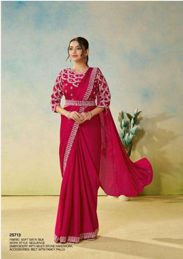
25713 FABRIC: SOFT SATIN SILK WORK STYLE: SEQUENCE EMBROIDERY WITH MULTI STONE HANDWORK. ACCESSORIES: BELT WITH FANCY PALLU.