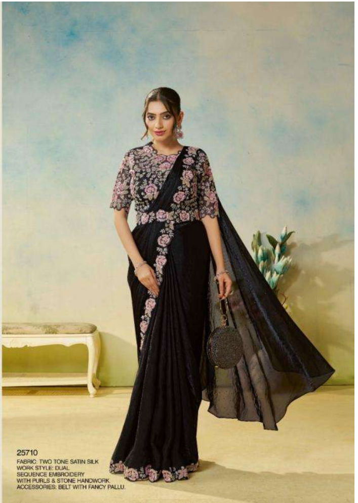
25710 FABRIC: TWO TONE SATIN SILK WORK STYLE: DUAL SEQUENCE EMBROIDERY WITH PURLS & STONE HANDWORK ACCESSORIES: BELT WITH FANCY PALLU.