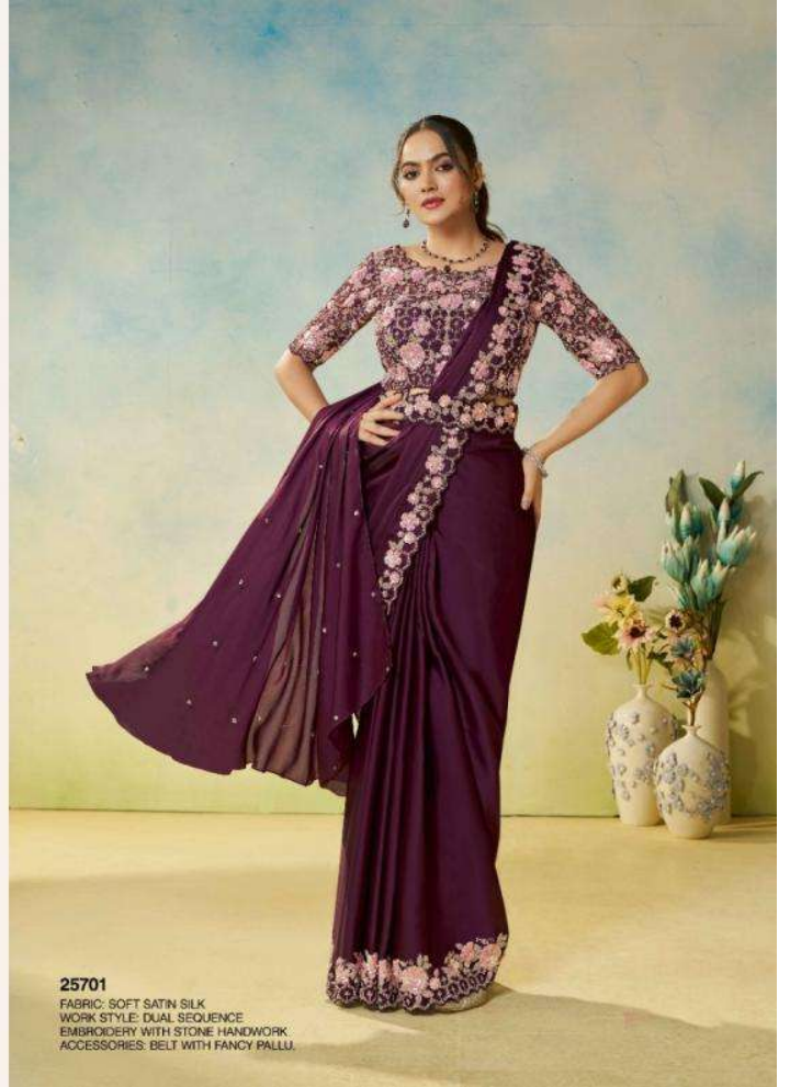
25701 FABRIC: SOFT SATIN SILK WORK STYLE: DUAL SEQUENCE EMBROIDERY WITH STONE HANDWORK ACCESSORIES: BELT WITH FANCY PALLU.