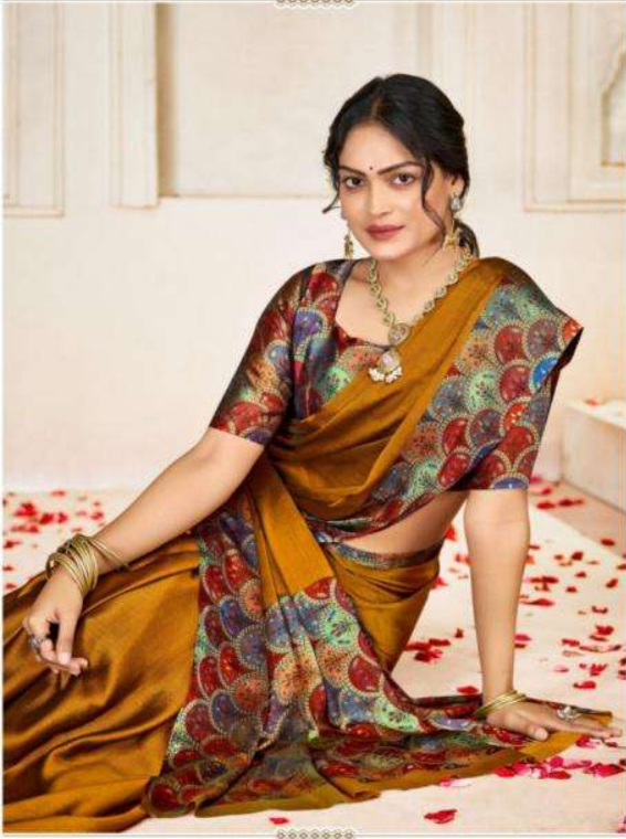
STEP OUT IN A STYLE THIS FESTIVE SEASON; REDEFINE YOUR STYLE WITH + 94007 +