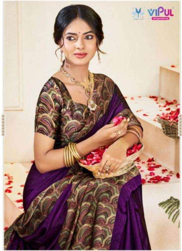
SHOW YOUR SAREE ZWAG IN THE MOST AMAZING WAY WITH GORGEOUS DESIGNS THIS SEASON. + 94010 +