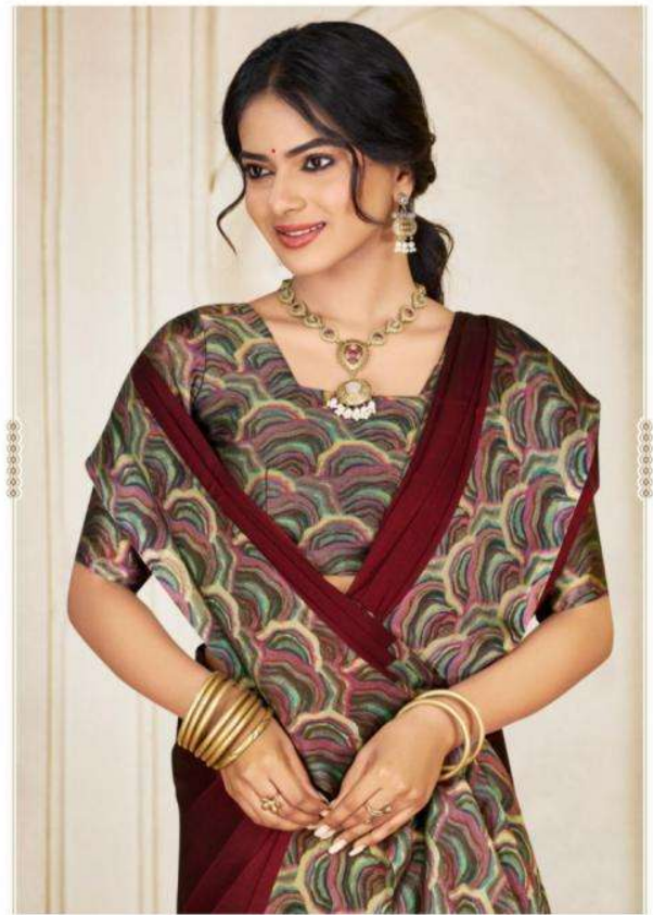
SHOWCASING AN UNPARALLELED COLLECTION OF SEASON'S BEST FASHION TRENDS + 94005 +