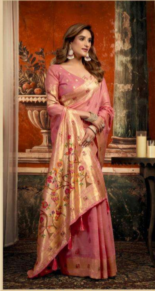
HIGH DESIGNED SAREES