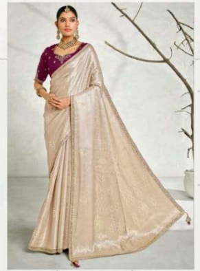
3008 W-PUCHI हरि