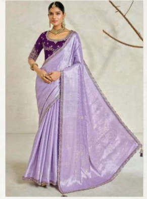
3004 W-PUCHI हरि