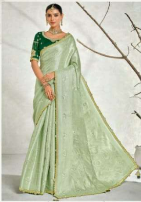
3005 W-PUCHI हरि