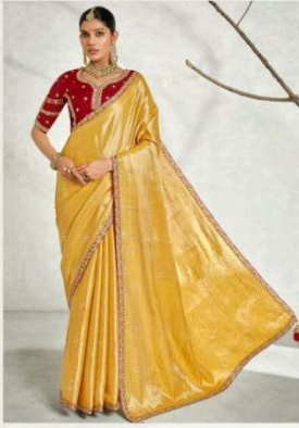
3001 W-PUCHI हरि