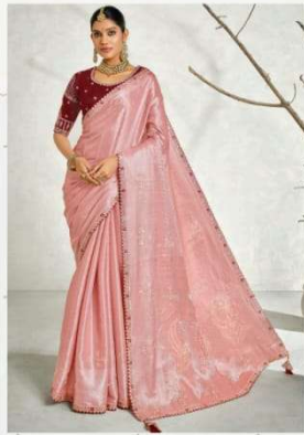
3006 W-PUCHI हरि