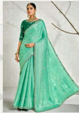
3007 W-PUCHI हरि