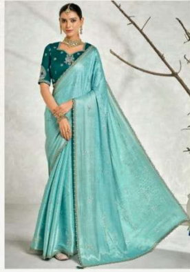
3002 W-PUCHI हरि