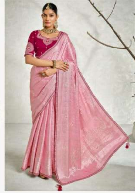
3003 W-PUCHI हरि