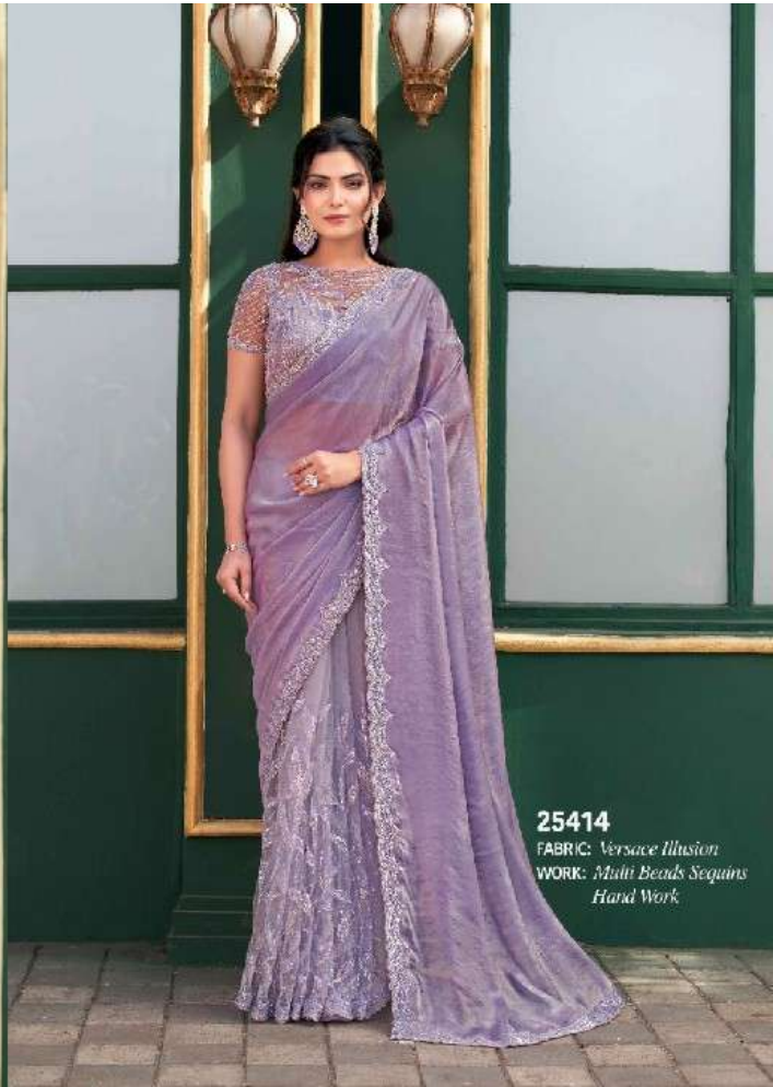
25414 FABRIC: Versace Illusion WORK: Multi Beads Sequins Hard Work