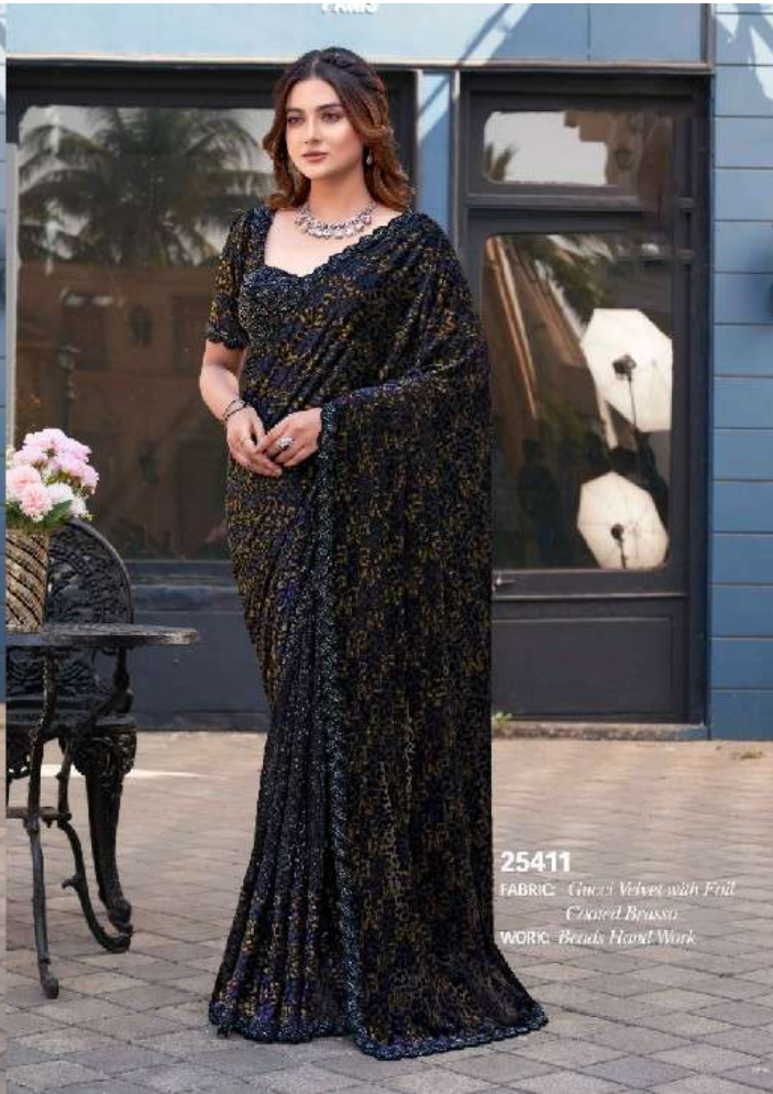
25411 FABRIC: Green Velvet with Full Caked Beads WORK: Beads Hand Work