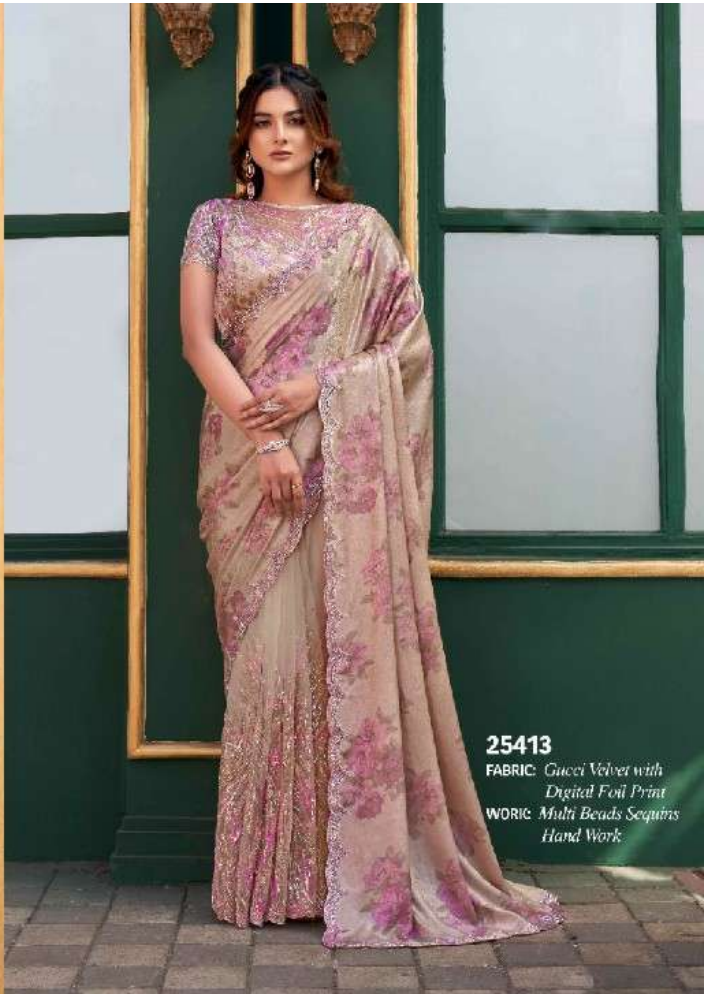
25413 FABRIC: Gucci Velvet with Digital Foil Print WORK: Multi Beads Sequins Hand Work