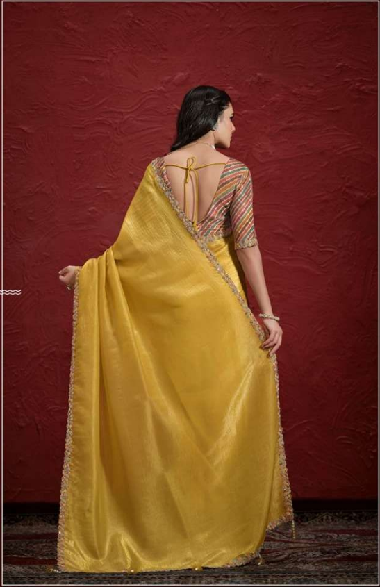
24202 FABRIC : PAPER SILK CRINKLE BLOUSE : RANGKAT EMBROIDERY Ready to wear