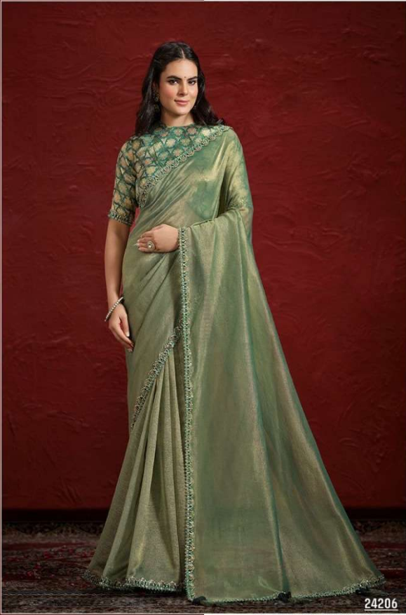
FABRIC : PURE BANARASI JARI PLEAT BLOUSE : WEAVE RANGKAT Ready to wear