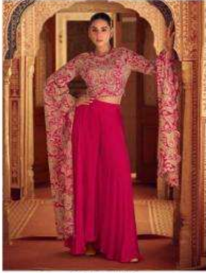
D NO : 5738