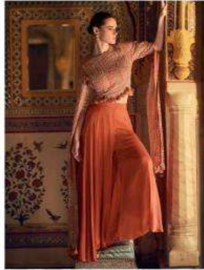
D NO : 5741