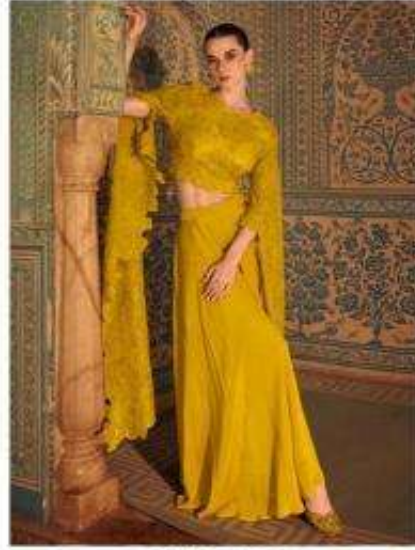
D NO : 5739