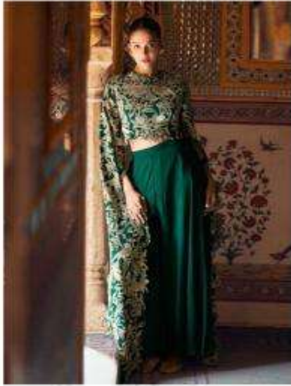
D NO : 5740