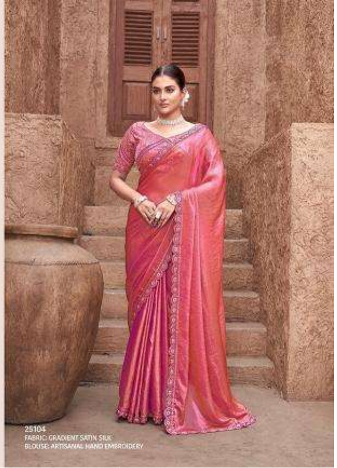
25104 FABRIC: GRADIENT SATIN SILK BLOUSE: ARTISANAL HAND EMBROIDERY