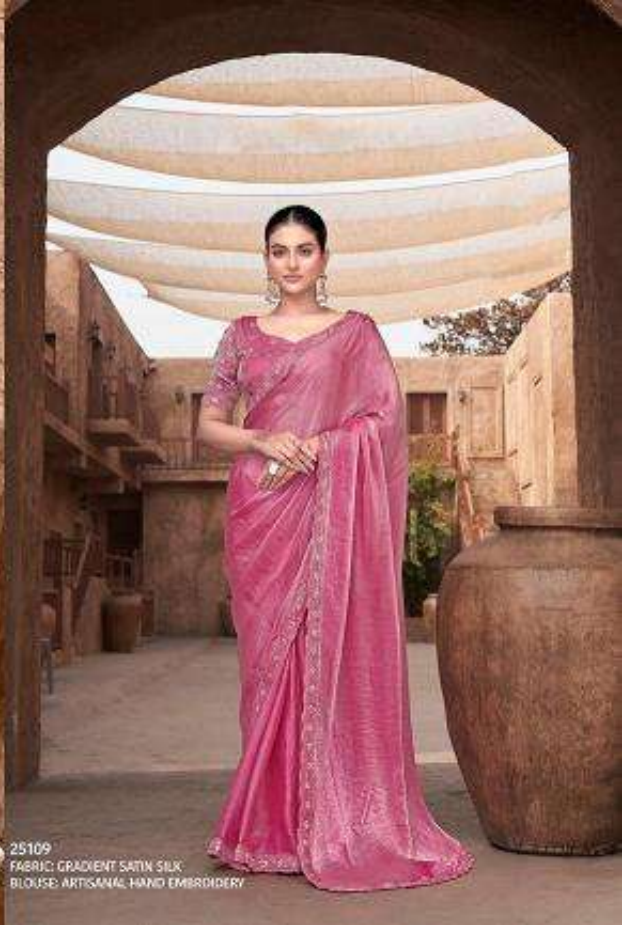
25109 FABRIC: GRADIENT SATIN SILK BLOUSE: ARTISANAL HAND EMBROIDERY