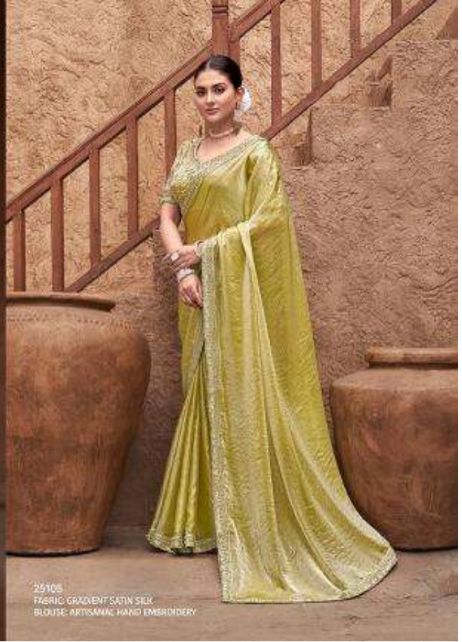
26106 FABRIC: GRADIENT SATIN SILK BLOUSE: ARTISANAL HAND EMBROIDERY