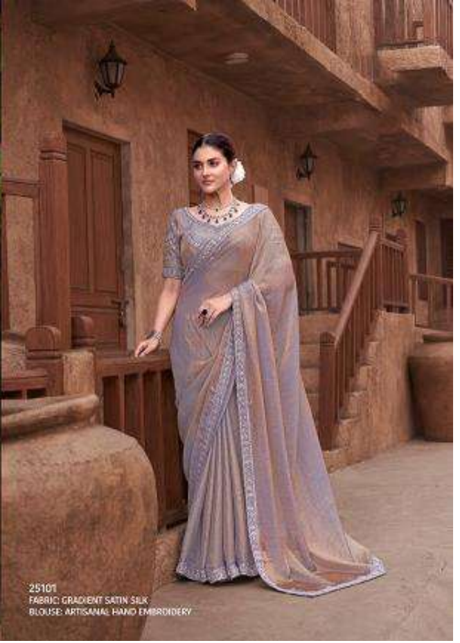
25101 FABRIC: GRADIENT SATIN SILK BLOUSE: ARTISANAL HAND EMBROIDERY