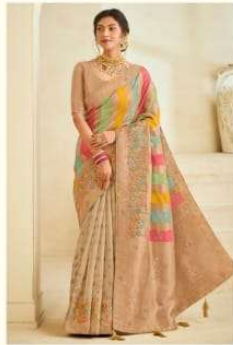
W - RANG UTSAV - 154