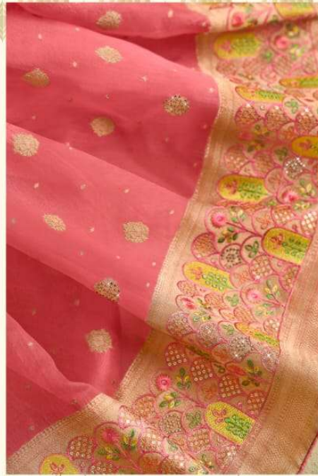
W - RANG UTSAV - 157

Discover the traditional side of Indian attire Adding the magical design