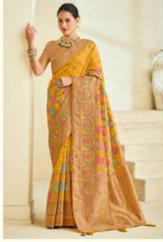
W - RANG UTSAV - 151