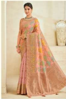
W - RANG UTSAV - 153