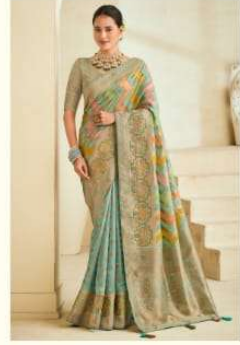
W - RANG UTSAV - 156