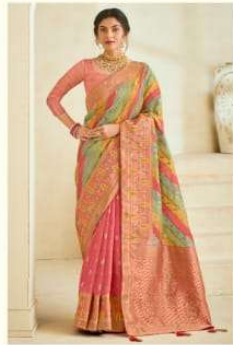
W - RANG UTSAV - 157