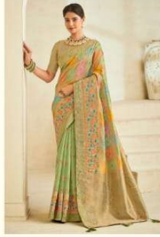
W - RANG UTSAV - 152