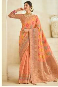
W - RANG UTSAV - 155