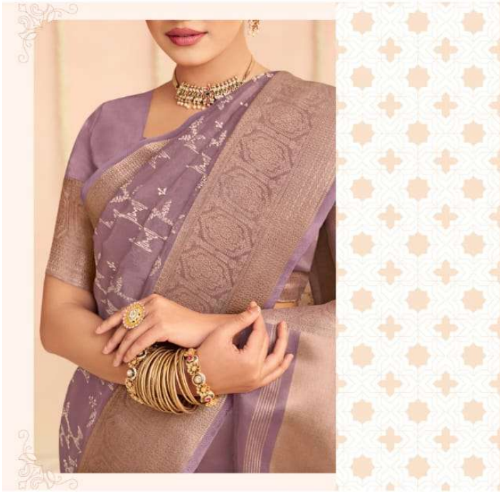
W - PREESHA - 704 Different patterns in one together is a tribute to fashion's biggest secret this season.