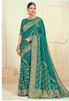
W - Roopam - 14