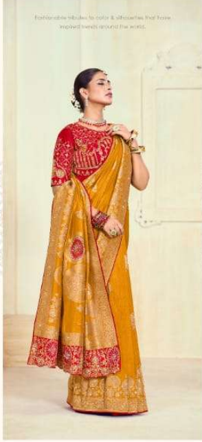
W - Roopam - 13

Tailor-made fabrics for color & finishes that bring inspired hands around the world.