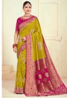
W - Roopam - 12