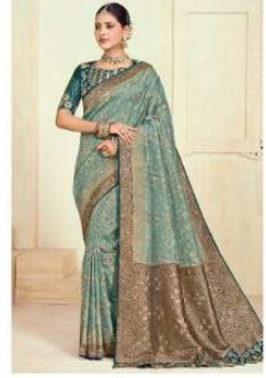
W - Roopam - 16