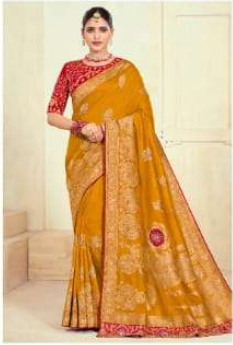
W - Roopam - 13