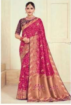
W - Roopam - 11