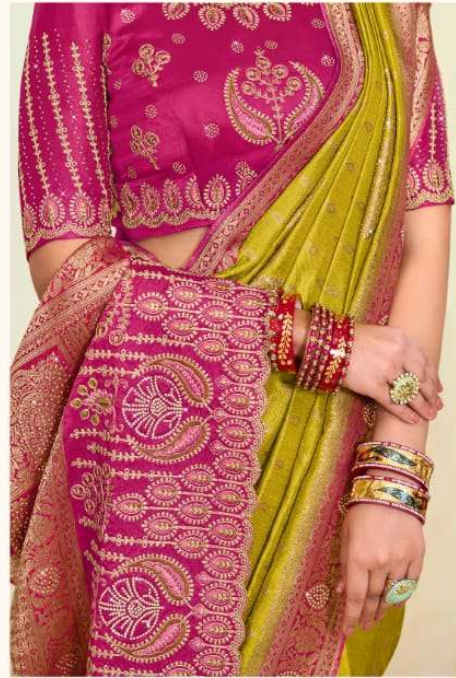
W - Roopam - 12

the focus of subtle ethnic wear that needs the contemporary glam slinky explodes with minute details of elegance