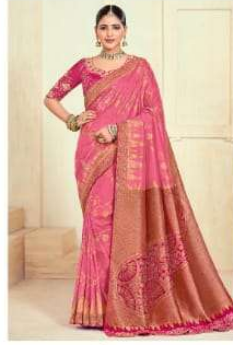
W - Roopam - 15