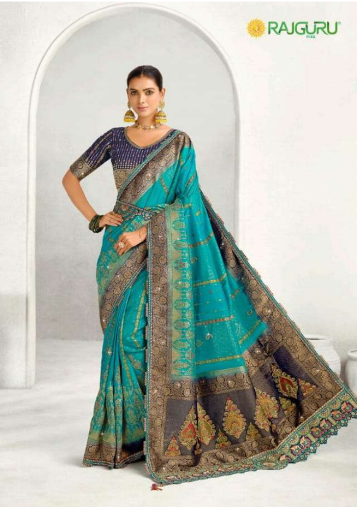
6504 | W-502900 | SIX YARDS OF ELEGANCE AND GRACE "Wrapped in tradition, cradling timeless, graceful beauty"