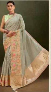
E BIBLI { 723 }