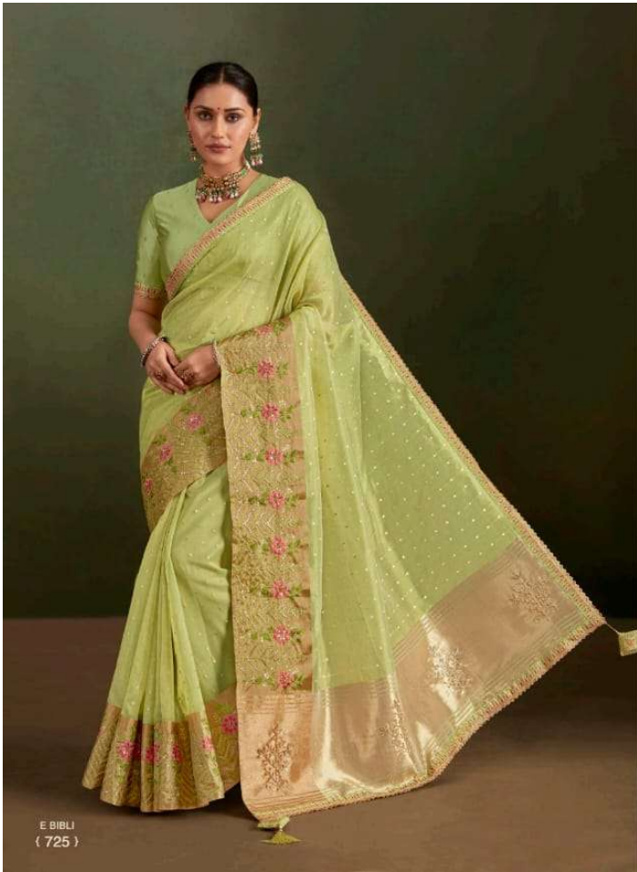
E BIBLI ( 725 )