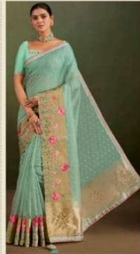
E BIBLI { 721 }