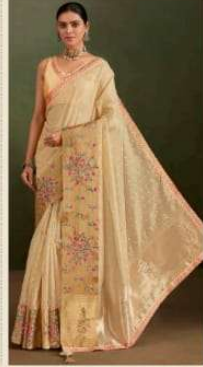
E BIBLI { 724 }