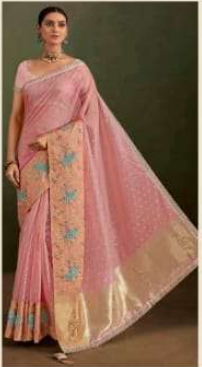
E BIBLI { 722 }