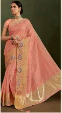
E BIBLI { 725 }