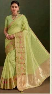
E BIBLI { 726 }