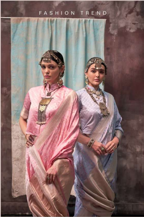
PURE SATIN HANDLOOM WEAVING SAREES