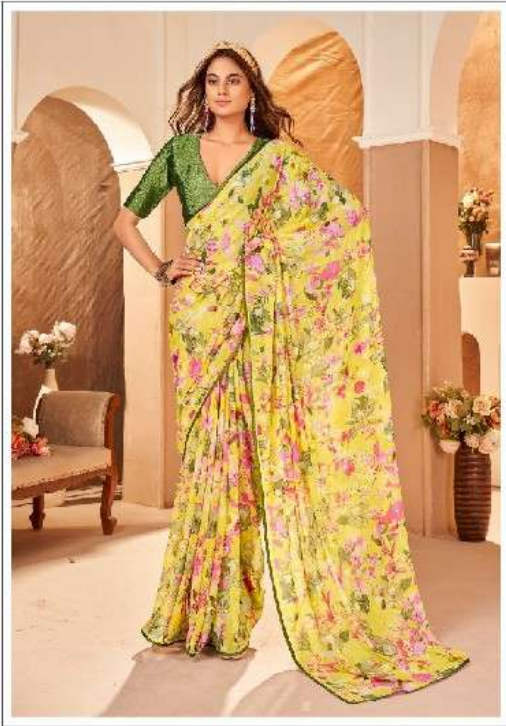
*Saree – because every day is a celebration of style D.NO:2004