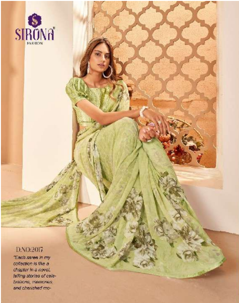
D.NO:2017 "Each saree in my collection is like a chapter in a novel, telling stories of celebrations, memories, and cherished mo-