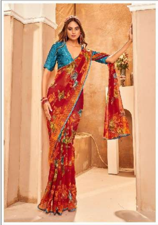
"Saree: A canvas of tradition, a masterpiece of fashion." D.NO:2001