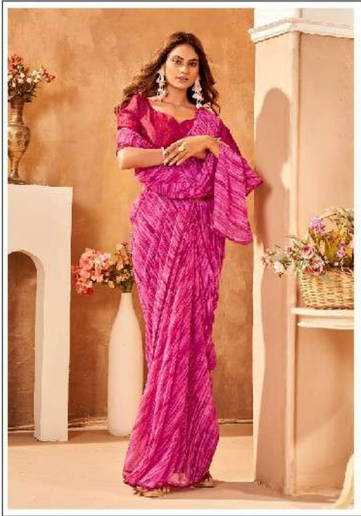
"Saree – where ethnic charm meets contemporary flair. D.NO:2009