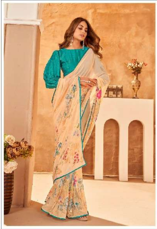
"In a saree, you're always dressed for success." D.NO.2011