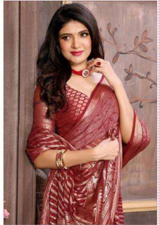
Her eyes have seen tomorrow A scintillating plethora of timeless masterpiece inspired by beauty from Indian culture D.NO. 2003