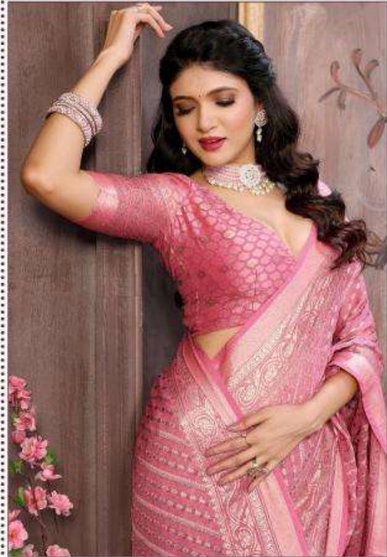
Fashion is inspire by youth & nostalgia. & draws inspiration from the best of the past.