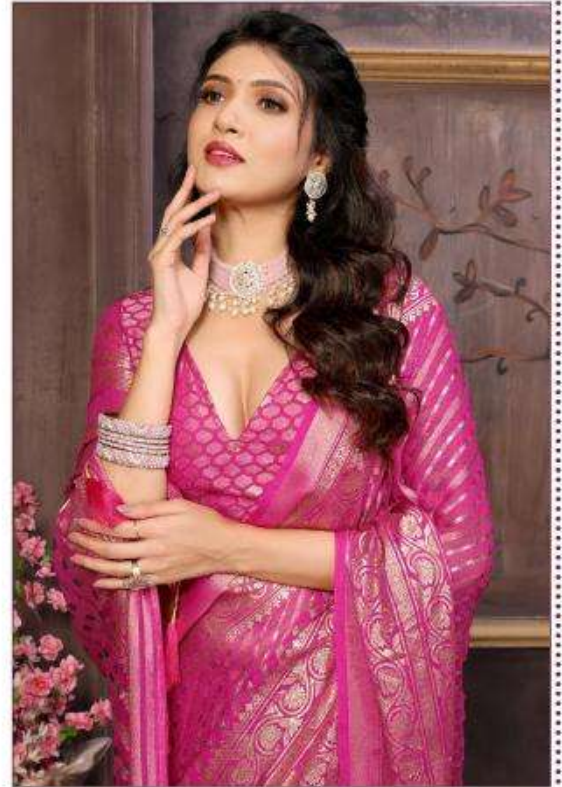
Fashion is inspire by youth & nostalgia & draws inspiration from the best of the past D.NO. 2001