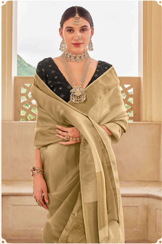
A garment of beauty, elegance, and gorgeous fabrics."