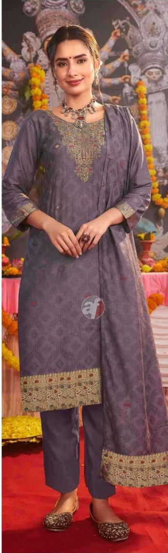
PALKI Vol-04 4044