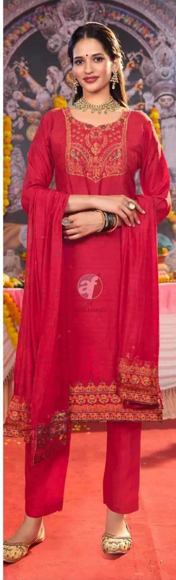
PALKI Vol-04 4045