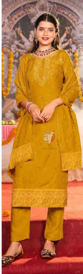
PALKI Vol-04 4042