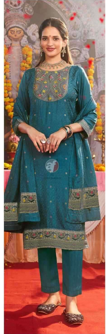
PALKI Vol-04 4043