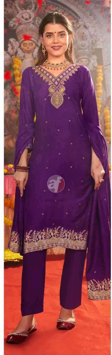
PALKI Vol-04 4046