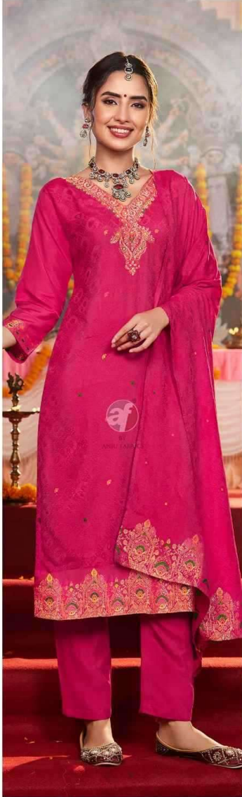
PALKI Vol-04 4041