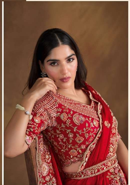
24710 Fabris : Two tone Satin Silk Blouse : Hand Work Embroidered