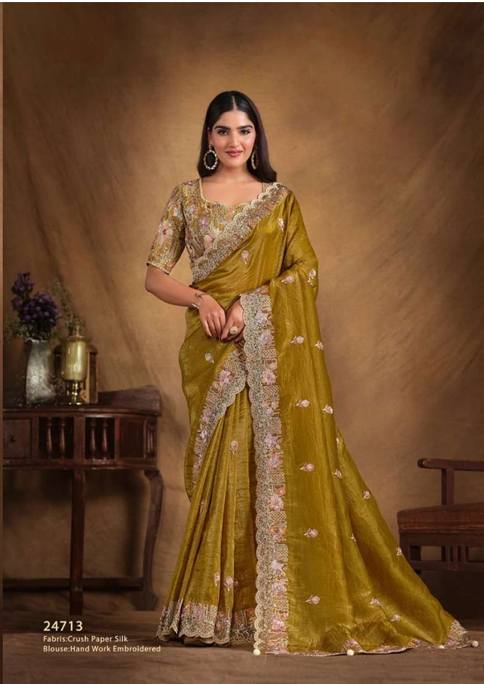
24713 Fabric:Crush Paper Silk Blouse:Hand Work Embroidered