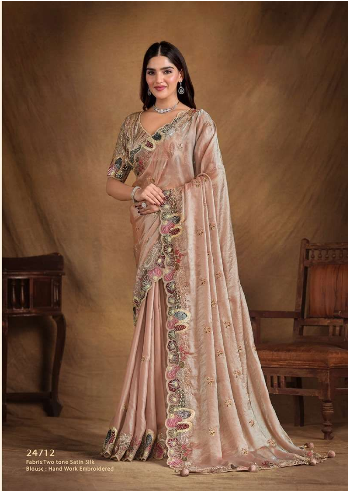
24712 Fabric: Two tone Satin Silk Blouse : Hand Work Embroidered