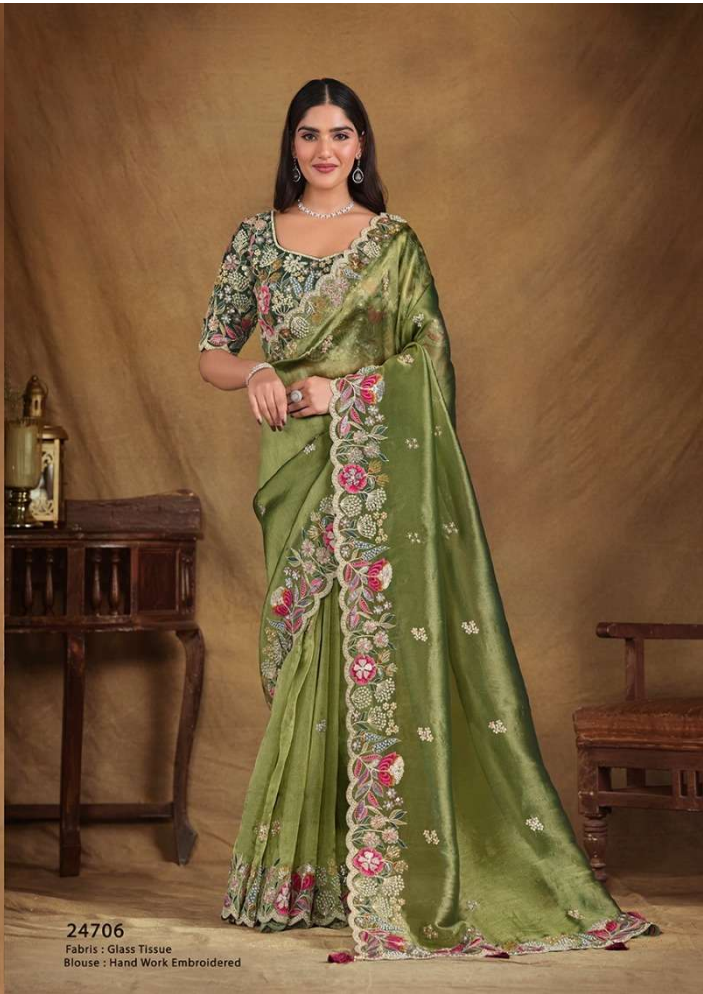
24706 Fabric : Glass Tissue Blouse : Hand Work Embroidered