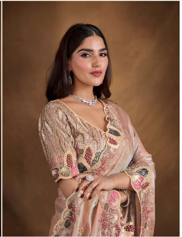
◆◆◆ 24712 Fabric: Two tone Satin Silk Blouse : Hand Work Embroidered