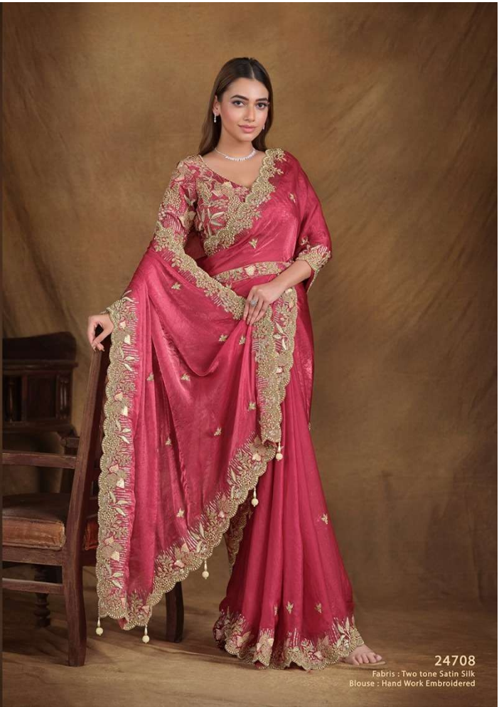
24708 Fabric: Two tone Satin Silk Blouse: Hand Work Embroidered