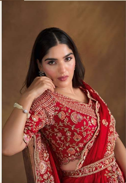
24710 Fabris : Two tone Satin Silk Blouse : Hand Work Embroidered