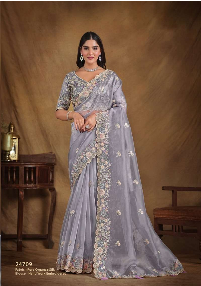
24709 Fabrics : Pure Organza Silk Blouse : Hand Work Embroidered