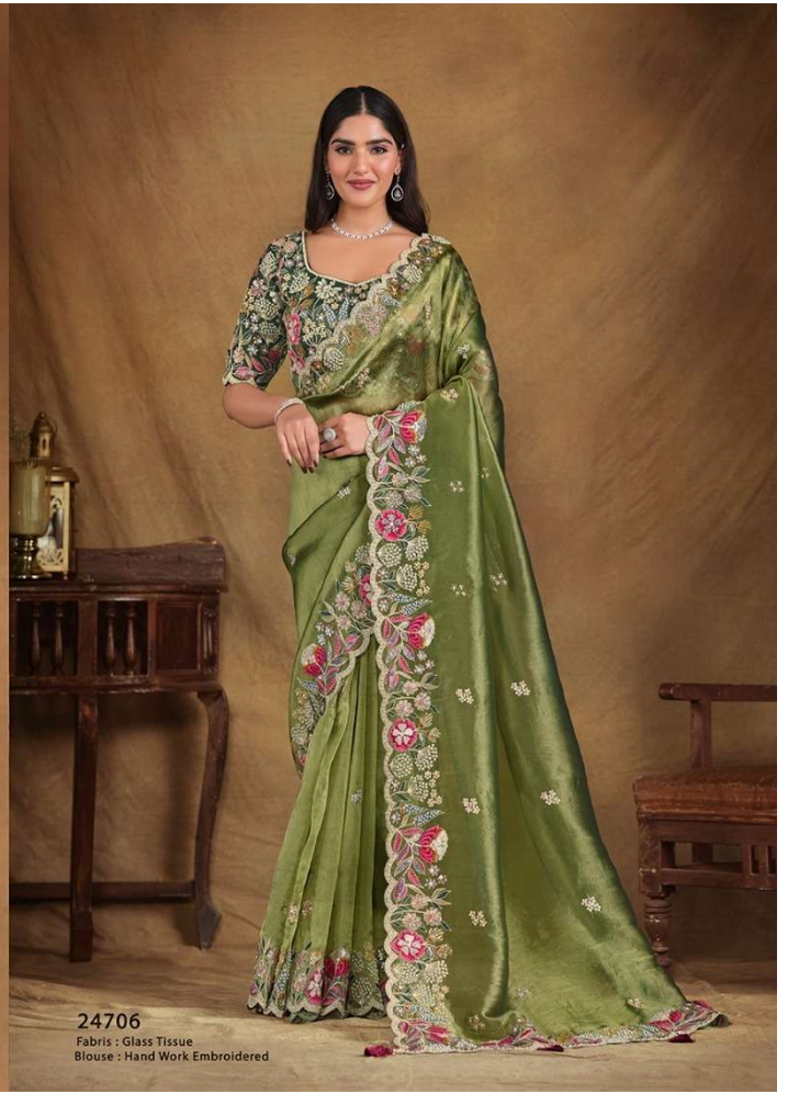
24706 Fabris : Glass Tissue Blouse : Hand Work Embroidered