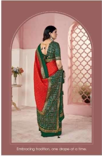
Embracing tradition, one drape at a time.