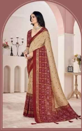
This saree isn't just a color, it's an experience.