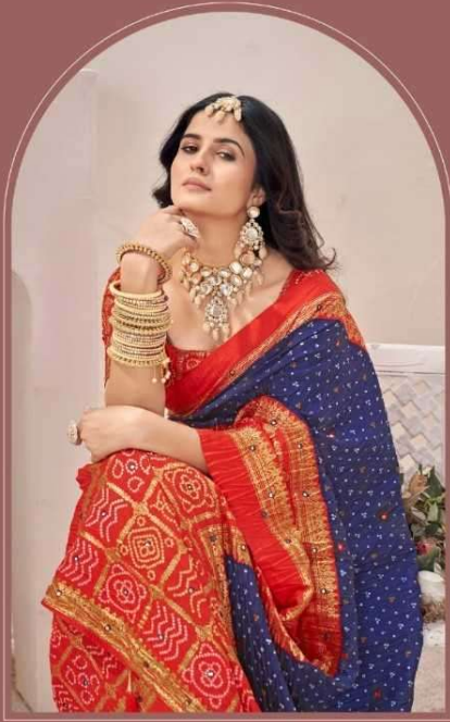
Draped In Heritage, Adorned With Elegance. This Saree Is My Canvas.