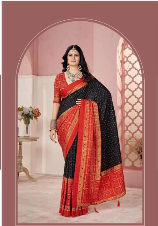
A beautiful saree is undoubtedly a head-turner.