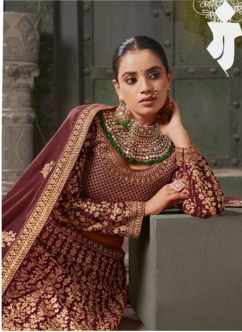
Overdressed and undercharged in this stunning lehenga D.no-12002-B