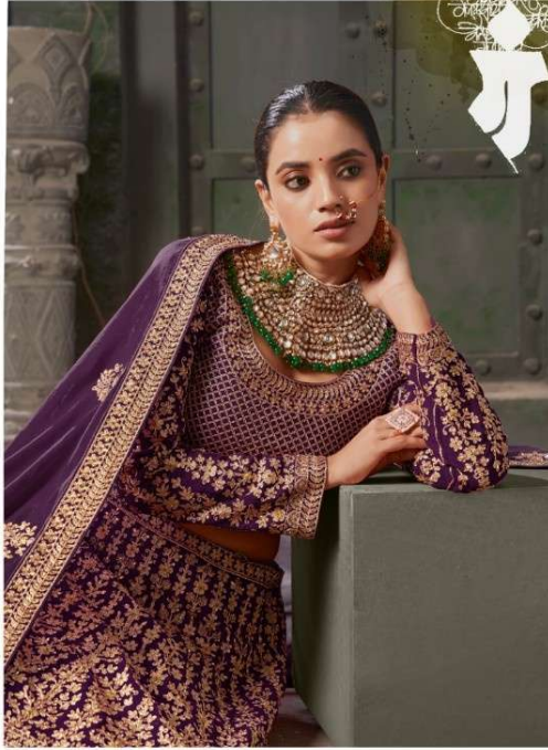
Overdressed and undercharged in this stunning lehenga D.no-12002 C