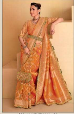
SRI MANIRATNAM - 06