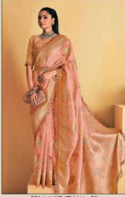
SRI MANIRATNAM - 01