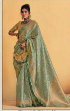
SRI MANIRATNAM - 05