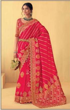
SRI MANIRATNAM - 03