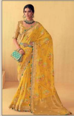
SRI MANIRATNAM - 04