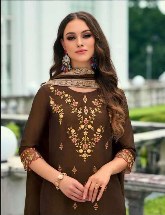
THE RICH MAROON HUE ADDS A TOUCH OF REGAL CHARM, MAKING IT IDEAL FOR FESTIVE OCCASIONS AND FORMAL EVENTS