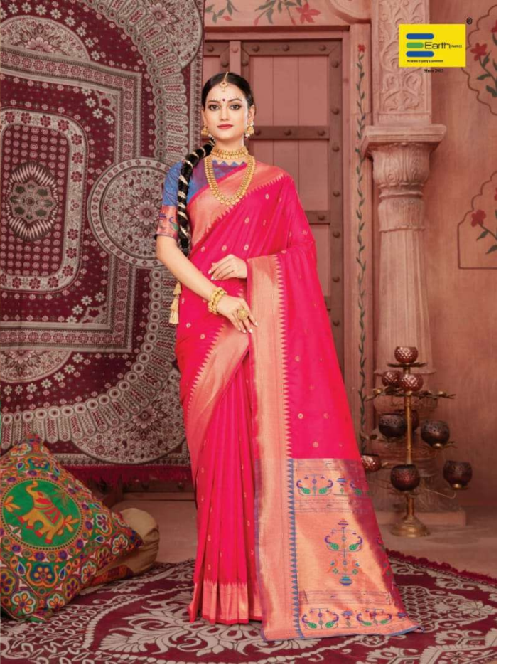
The collection named as "A wonderful world " was focused on cocktail evening & bridal wear with ornate sarees , sarees creating a world of intricate techniques colors& flattering silhouettes