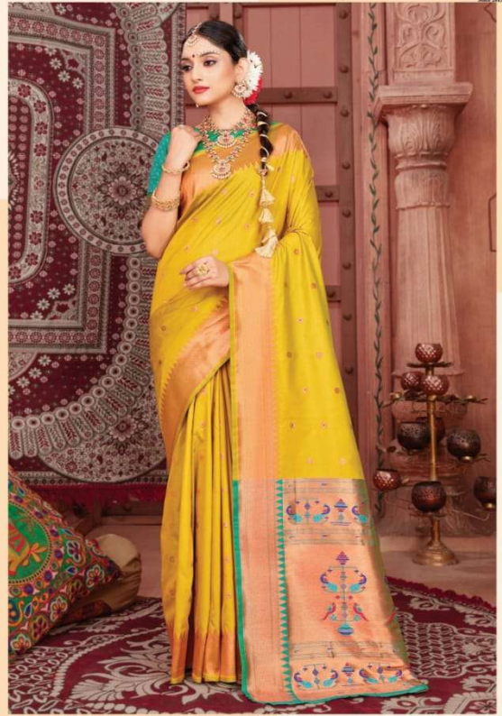
Bright yellow with blue combination - a very festive merge indulging different shades. contemporary yoke design with ctwork border to edge, a perfect design for any occasion any time....