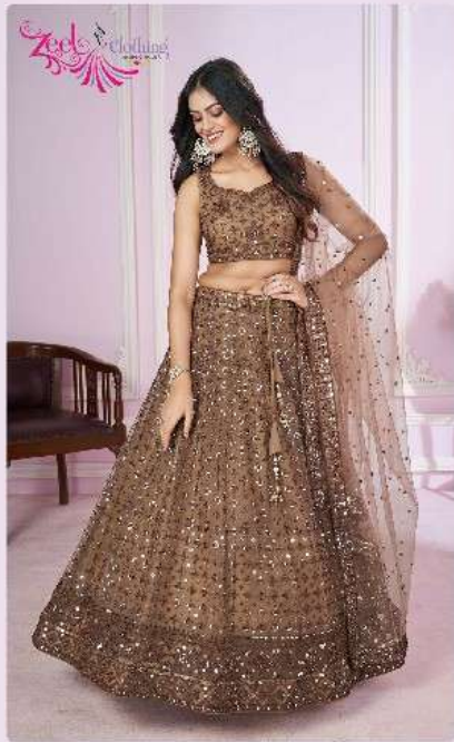
Embrace yourself with a glamorous look with this amazing subtle collection.