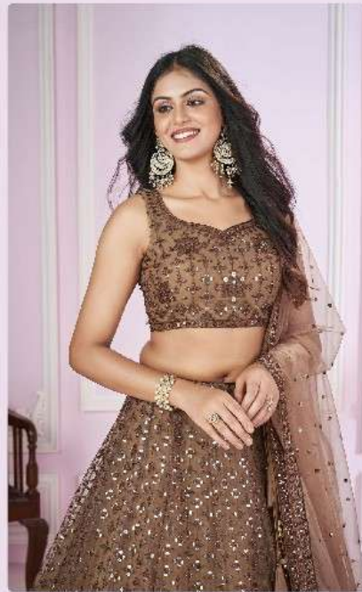
Embrace yourself with a glamorous look with this amazing subtle collection.