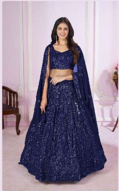
Embrace yourself with a glamorous look with this amazing sabbie collection.