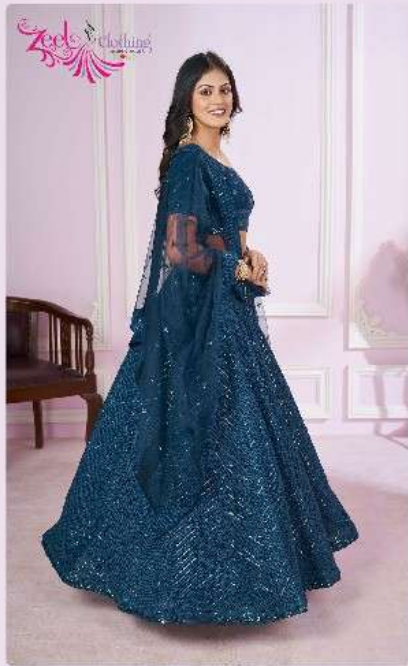
Embrace yourself with a glamorous look with this amazing ethnic collection.