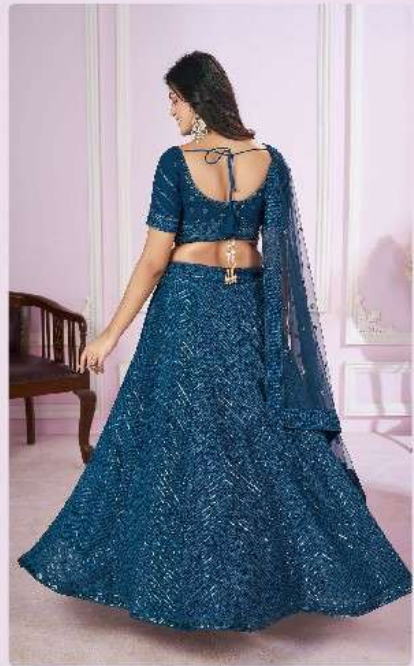
Embrace yourself with a glamorous look with this amazing ethnic collection.