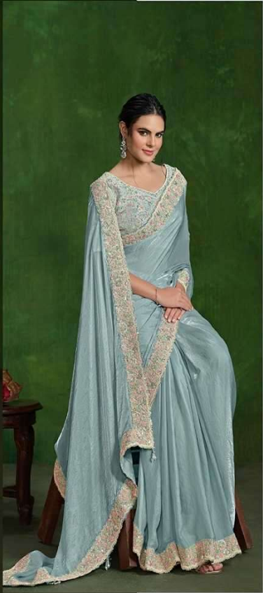
24304 FABRIC : TWO-TONE SIMMER SATIN BLOUSE : EMBROIDERED READY TO WEAR