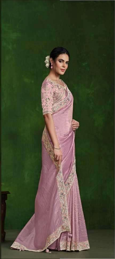
24305 FABRIC : PAPER CREPE SILK BLOUSE : EMBROIDERED READY TO WEAR

Ranjhana - A collection that is specifically curated to make your special moments memorable.