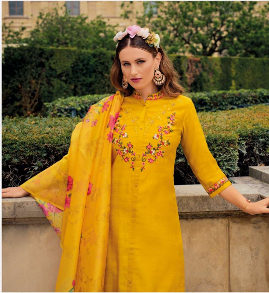
BRIGHTEN Up festive mood