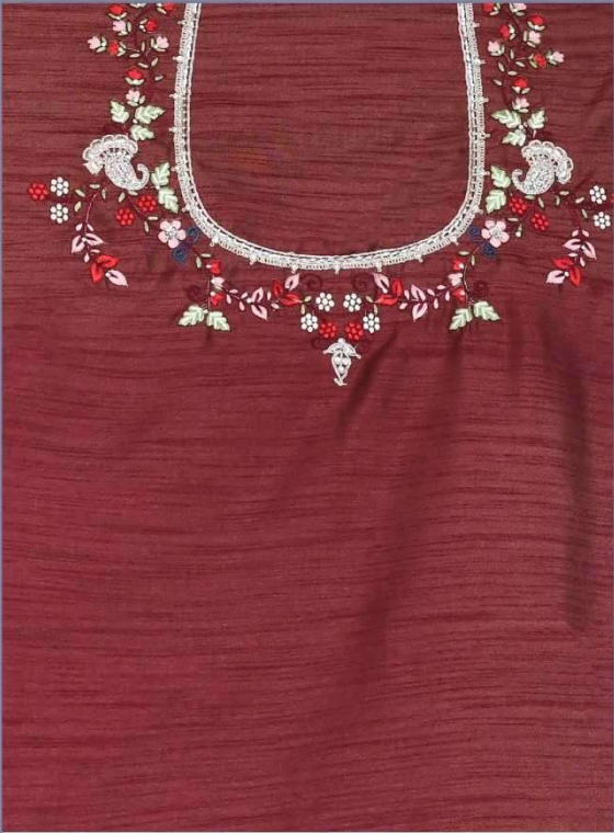
Blouse Fabric N8153 A