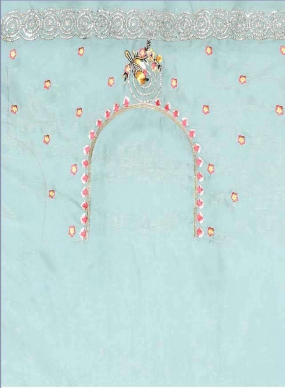
Blouse Fabric N8228 B