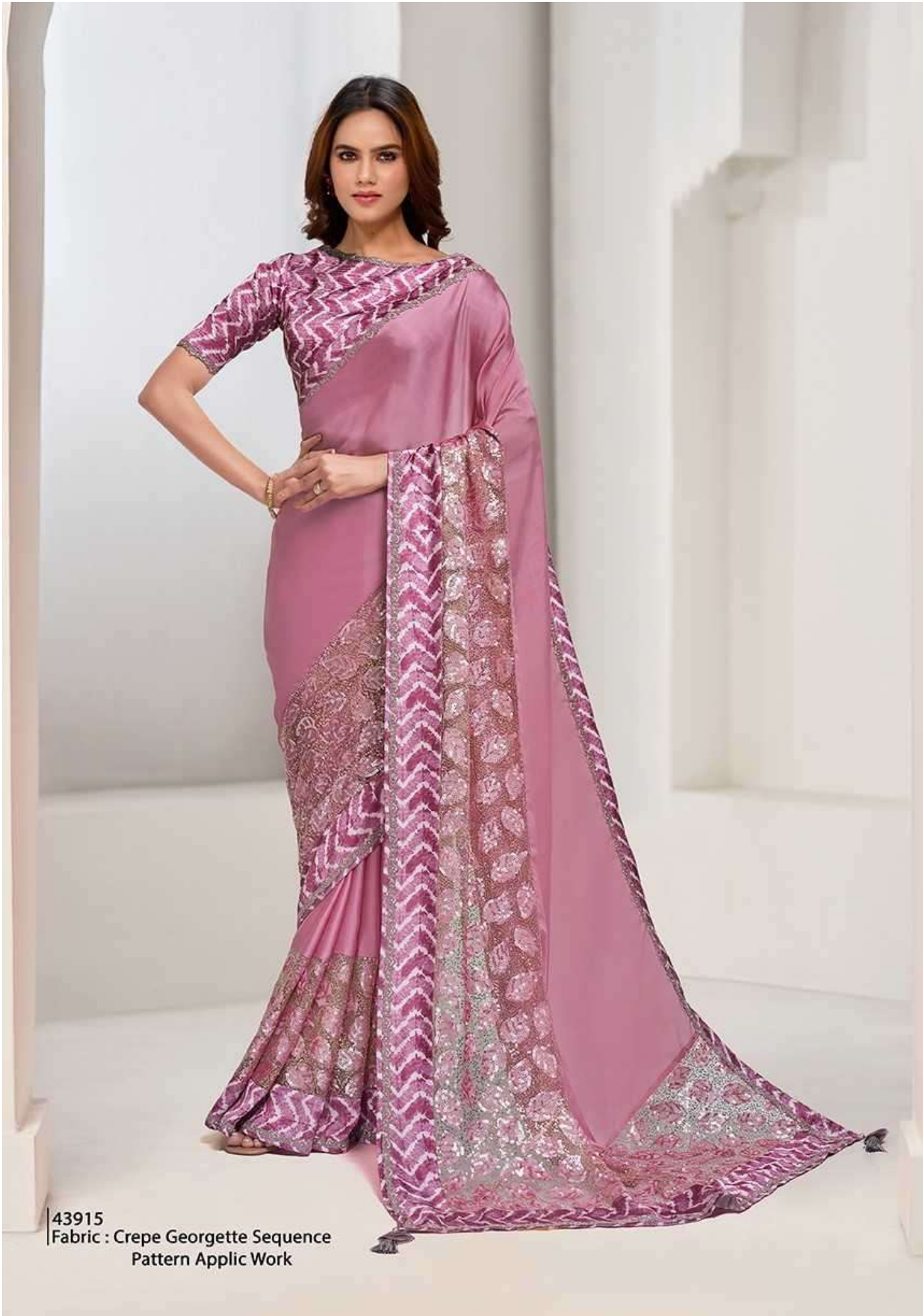
43915 Fabric : Crepe Georgette Sequence Pattern Applic Work