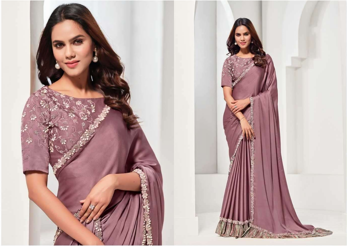
43914 FABRIC : Crape Satin Silk