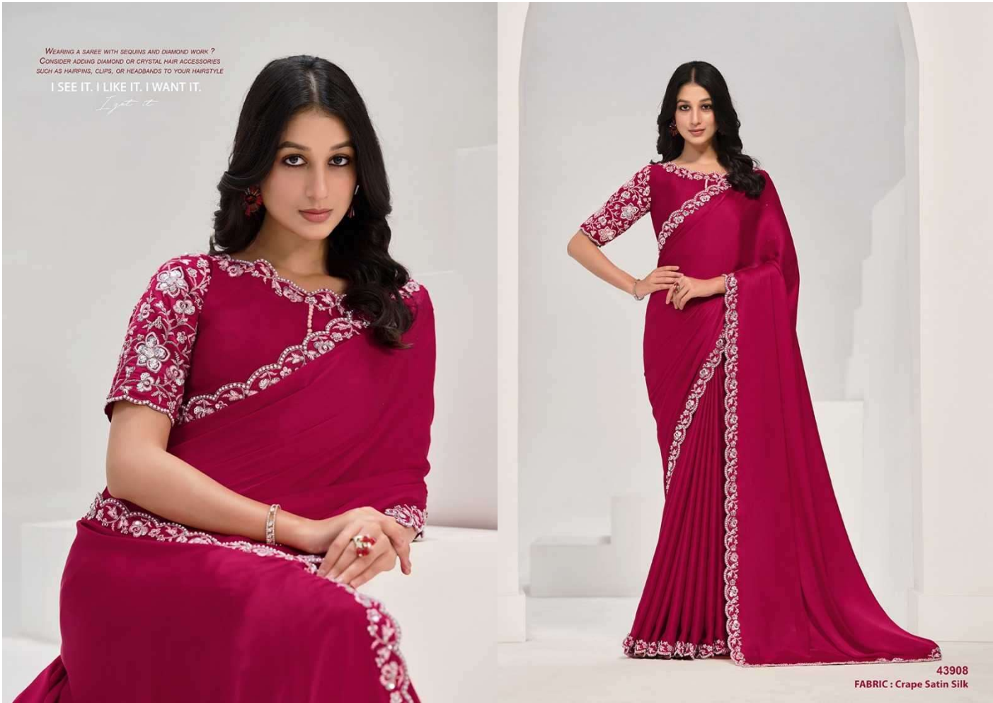
43908 FABRIC : Crape Satin Silk