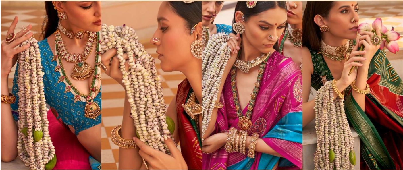
A Patola sari is a double ikat woven sari, usually made from silk, made in Patan, Gujarat, India. The word patola is the plural form; the singular is patolu. These saris are made using silk threads that are first dyed with natural colors and then woven together to create the intricate patterns and designs. They are usually worn for special occasions, such as weddings and formal events.