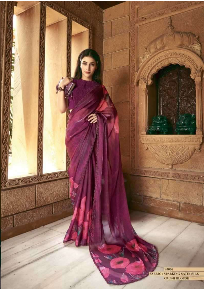
43806 FABRIC: SPARKING SATIN SILK CRUSH BLOUSE