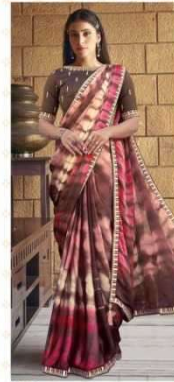
43813 FABRIC : CREPE GEORGETTE