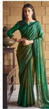
43809 FABRIC : SPARKING SATIN SILK