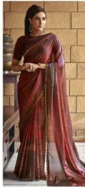
43808 FABRIC : SPARKING SATIN SILK CRUSH BLOUSE