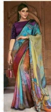
43811 FABRIC : SPARKING SATIN SILK