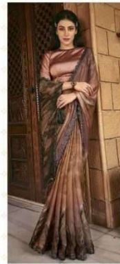
43810 FABRIC : SPARKING SATIN SILK