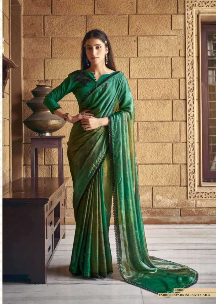
43809 FABRIC: SPARKING SATIN SILK