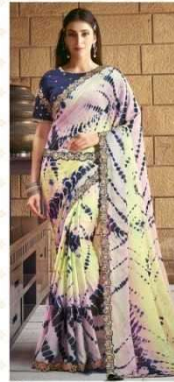
43812 Fabric : Satin Silk Georgette Accessorized with : A Designer Belt