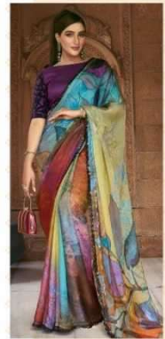
43811 FABRIC : SPARKING SATIN SILK