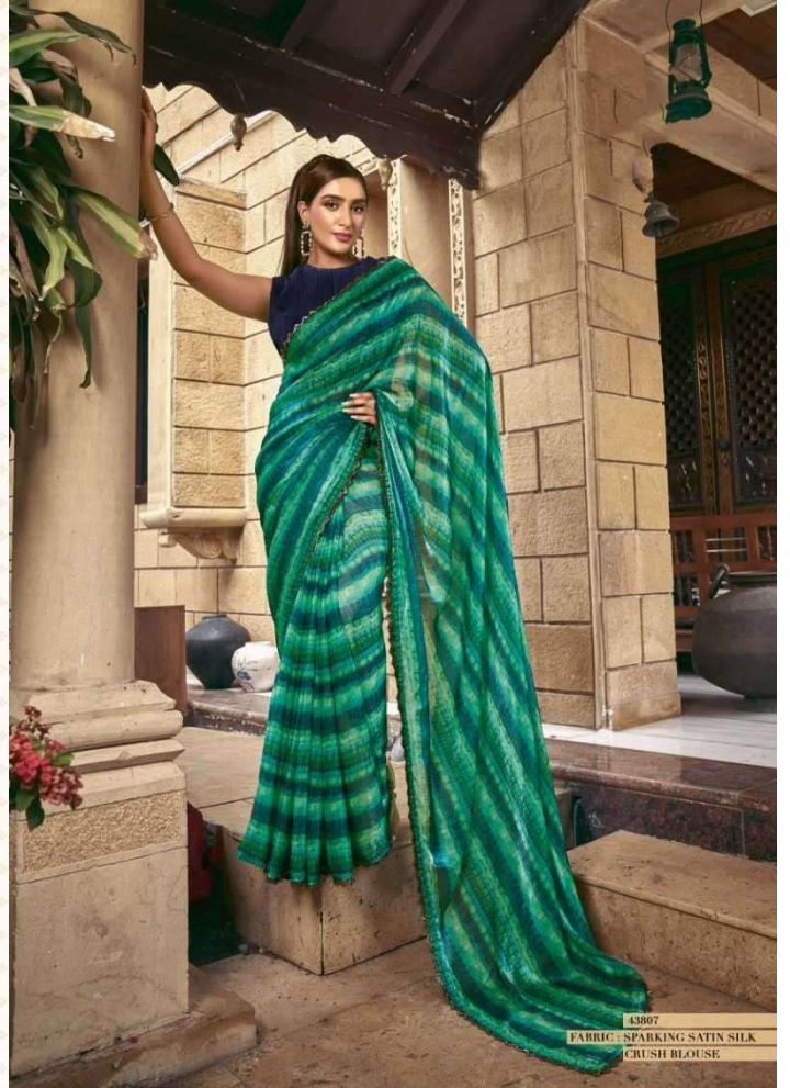
43807 FABRIC: SPARKING SATIN SILK CRUSH BLOUSE