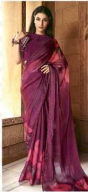
43806 FABRIC : SPARKING SATIN SILK CRUSH BLOUSE