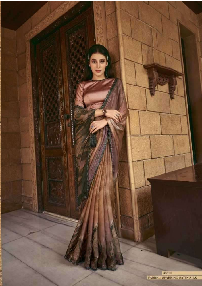
43810 FABRIC: SPARKING SATIN SILK