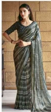
43805 FABRIC : SPARKING SATIN SILK