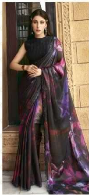
43803 FABRIC : SPARKING SATIN SILK CRUSH BLOUSE