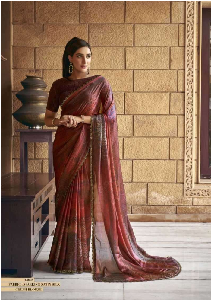
43908 FABRIC: SPARKING SATIN SILK CRUSH BLOUSE