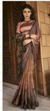
43810 FABRIC : SPARKING SATIN SILK