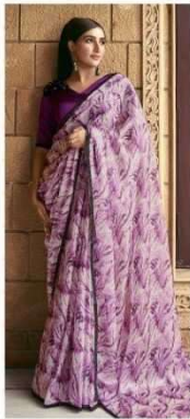
43804 FABRIC : SPARKING SATIN SILK