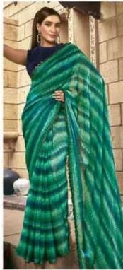
43807 FABRIC : SPARKING SATIN SILK CRUSH BLOUSE