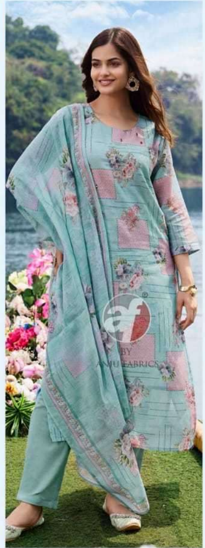
Pretty Petals VOL-2 D.no.3766