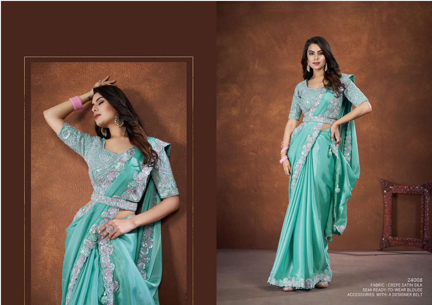
24008 FABRIC : CREPE SATIN SILK SEMI READY-TO-WEAR BLOUSE ACCESSORIES WITH: A DESIGNER BELT