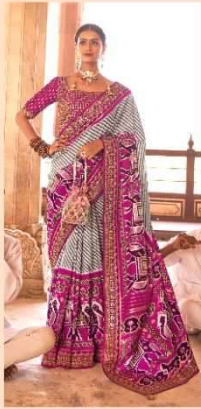
R-108 A (EMB-BR-BP)