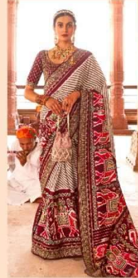
R-108 F (EMB-BR-BP)