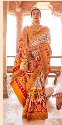
R-108 G (EMB-BR-BP)