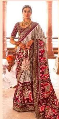
R-108 F (EMB-BR-BP)