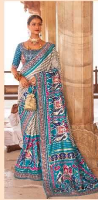
R-108 D (EMB-BR-BP)