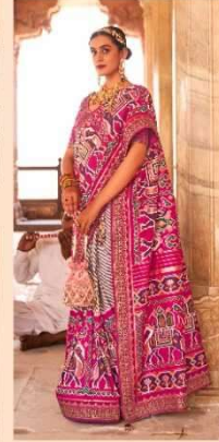
R-108 I (EMB-BR-BP)