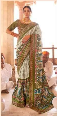
R-108 B (EMB-BR-BP)