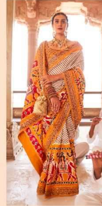
R-108 G (EMB-BR-BP)