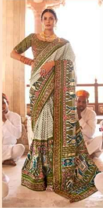
R-108 B (EMB-BR-BP)