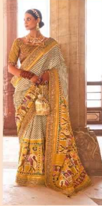
R-108 C (EMB-BR-BP)