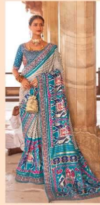
R-108 D (EMB-BR-BP)