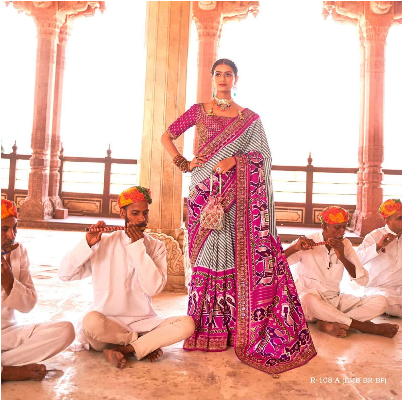
R-108 A (EMB-BR-BP)