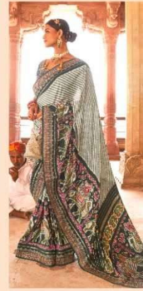
R-108 E (EMB-BR-BP)