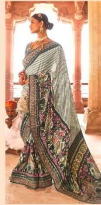
R-108 E (EMB-BR-BP)