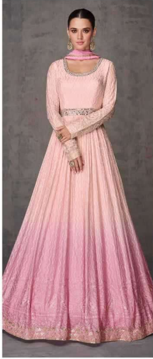
D NO : 5356