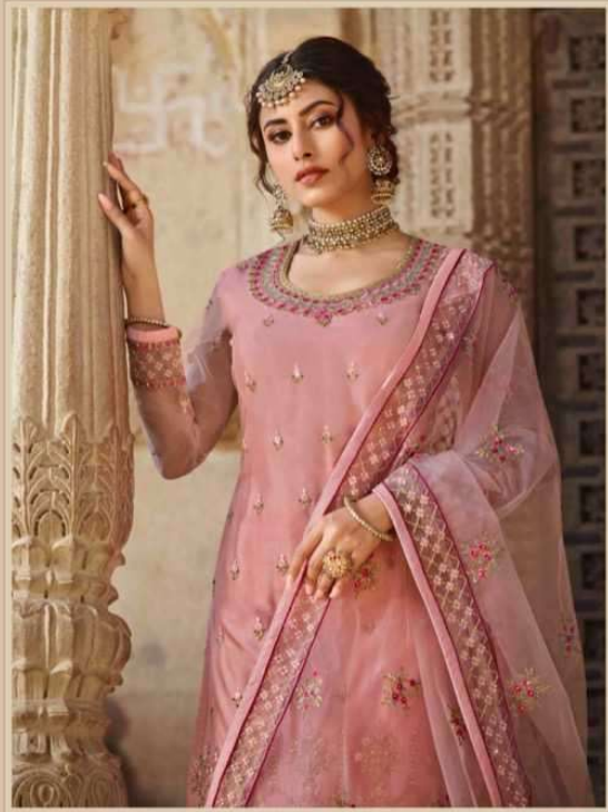
I am : striking / I am dramatically beautiful in my own skin and in my own .