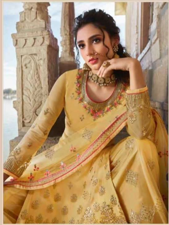
I am : eminent . I am effortlessly famous in my sphere of people .