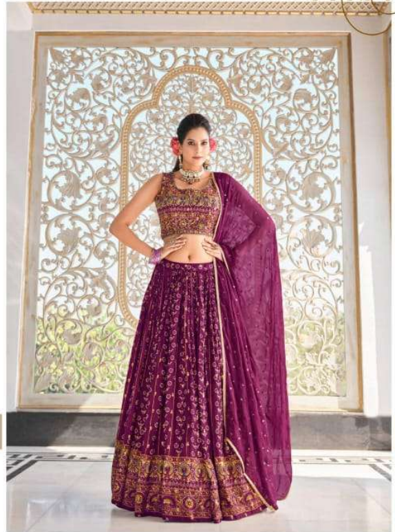
For elegance and class 3003