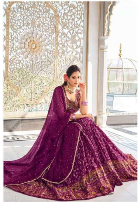
For elegance and class