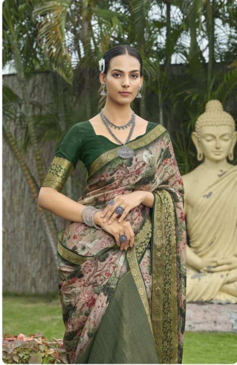
T H E R E V E L T R Y INFINITELY COUTURE MY EXPRESSION , MY PRIDE