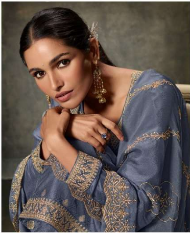
Brighten up your festive mood D.NO.14873