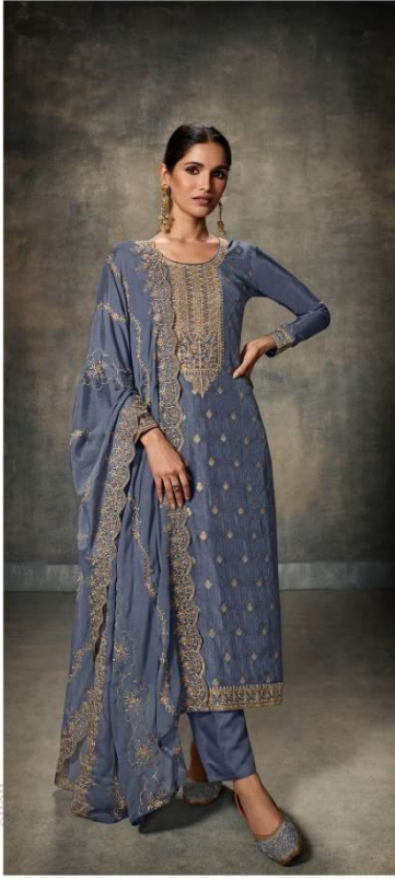
Brighten up your festive mood D.NO.14873