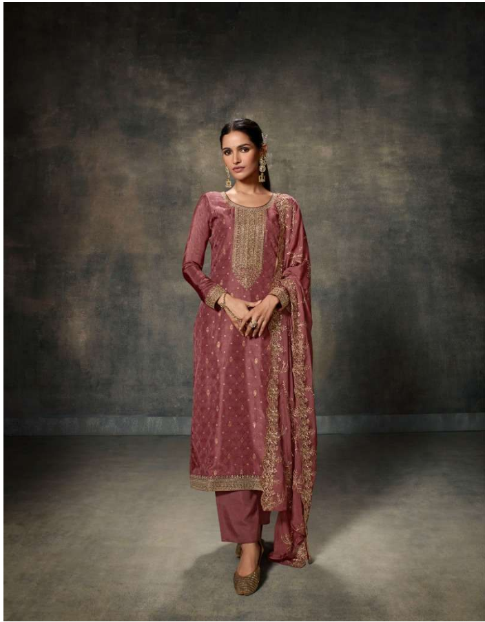
Set your own fashion goals D.NO. 14875