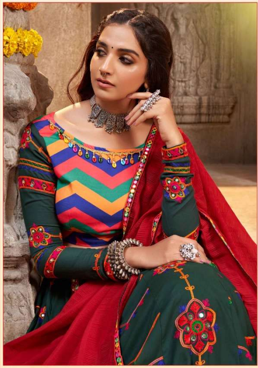
Smart sense of fashion