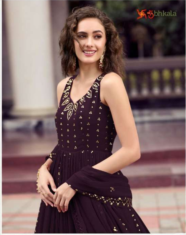
With its richly embroidered bodice and tulle, this gorgeous gown is a perfect balance of feminine elegance.