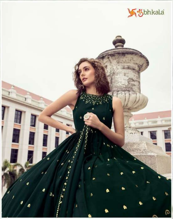
With its richly embroidered border and facets, this gorgeous green sari perfectly enhances the feminine silhouette.