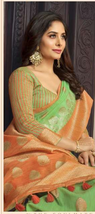
*** THE SOULMATE ***