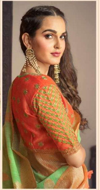
DOUBLE BLOUSE ***