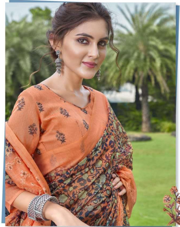
IN A BEAUTIFUL SAREE A GIRL IS LOFTY