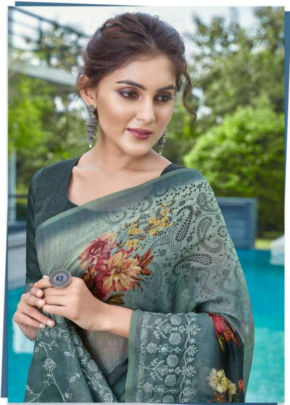
THE BEST CREATES. THE REST FOLLOWS 2751