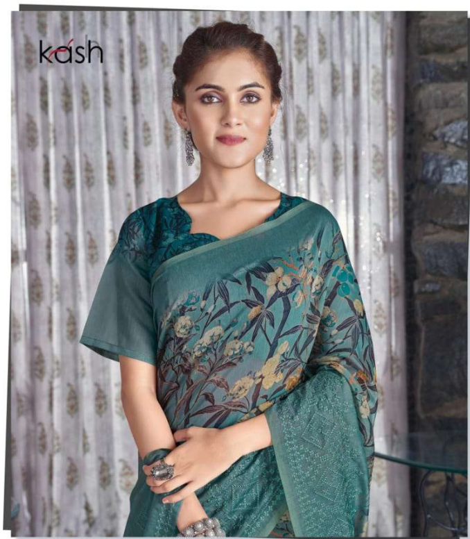
DRAPED IN LAYERS, THAT GENTLY HOLD 2759