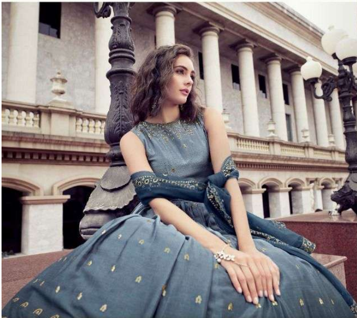
The delicate beauty of a hue like from looks only glimmers with all over subtle embellishment. This stunning lehenga frames a contemporary design highlighted with traditional embroidery. Inspired by the beauty of a Tuscan Summer, this ensemble is a celebration of joyous occasions.